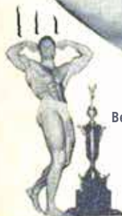
Be taller than a trophy!

Rancid Puss, world's most rancid man says: "You can be a mountain of mighty stenches - with pong oozing out of every pore on your power-packed, jet-charged body! Do what I did - follow Weirdo as your leader - mail that coupon for your FREE SMELL COURSE TODAY!"