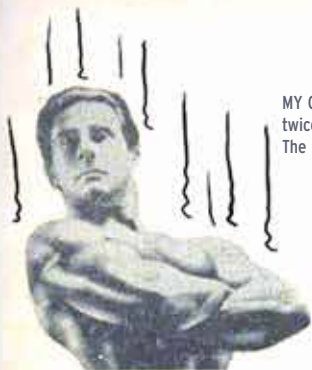
"The Musk Builder" "Smeller of Champions"